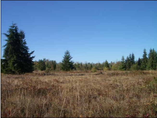
Meadows on Yelm Meadows #15