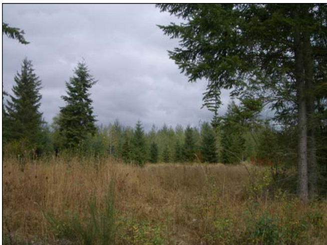
Meadows & trees on Yelm Meadows #9