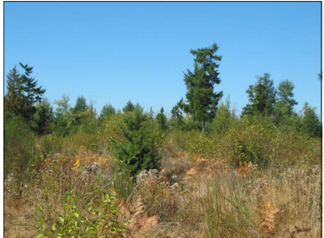
Yelm Meadows #12