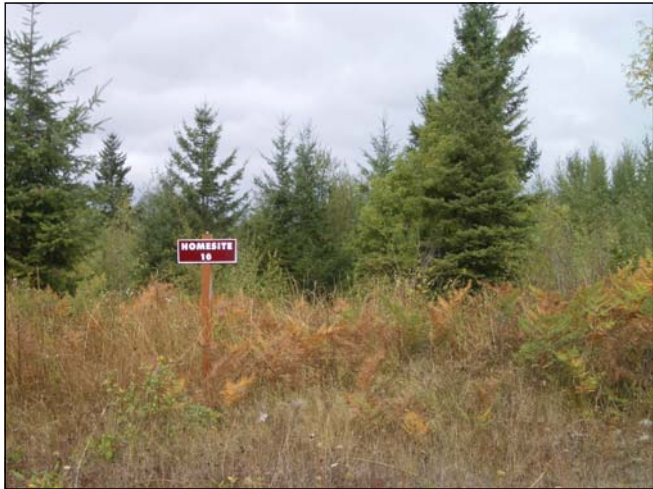
Trees & Meadows on Yelm Meadows #14