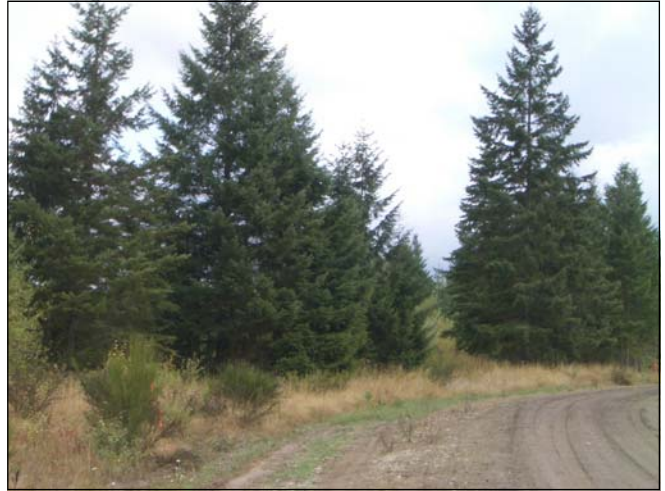
Yelm Meadows #10